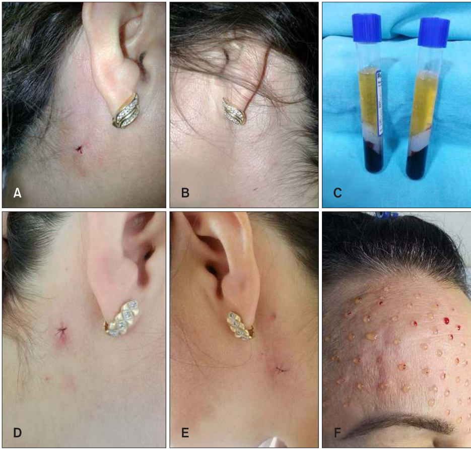
Fig. 1. The first biopsy was obtained from the right infra-auricular area before treatment (A). Saline was injected to the left infra-auricular area (B). Platelet-rich plasma (PRP) (C) was injected to the upper site of this right infra-auricular area (A) and face (F). On day 28 after PRP and saline injections, punch biopsy was performed on PRP (C) injected to the upper site of this right infra-auricular area (D) and control (saline injected area) site (E).