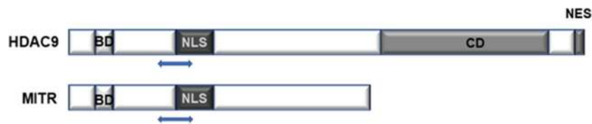
Fig. 1 Schematic diagram of functional domains of HDAC9 and MITR. HDAC9 contains a MEF2 binding domain (BD) at the N-terminus, a nuclear localization signal (NLS), a C-terminal catalytic domain (CD) and a nuclear export signal (NES) near the C-terminus. MITR is a splice

variant of HDAC9 that lacks a HDAC CD domain and NES. Double arrow heads indicate the region that HDAC9 and MITR share (450-600 amino acids) in their N-terminal domains with other members of class IIa HDACs