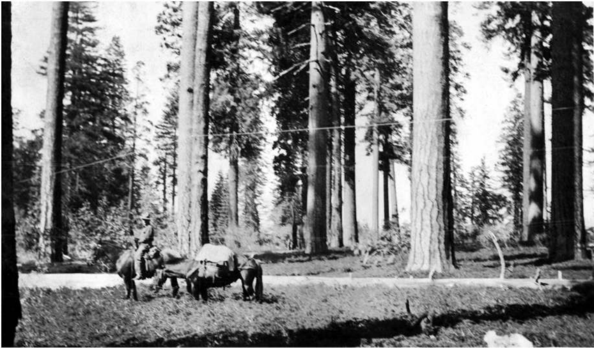
Fig. 2. Historic conditions in a ponderosa pine stand on the Sierra National Forest (ca. 1917).