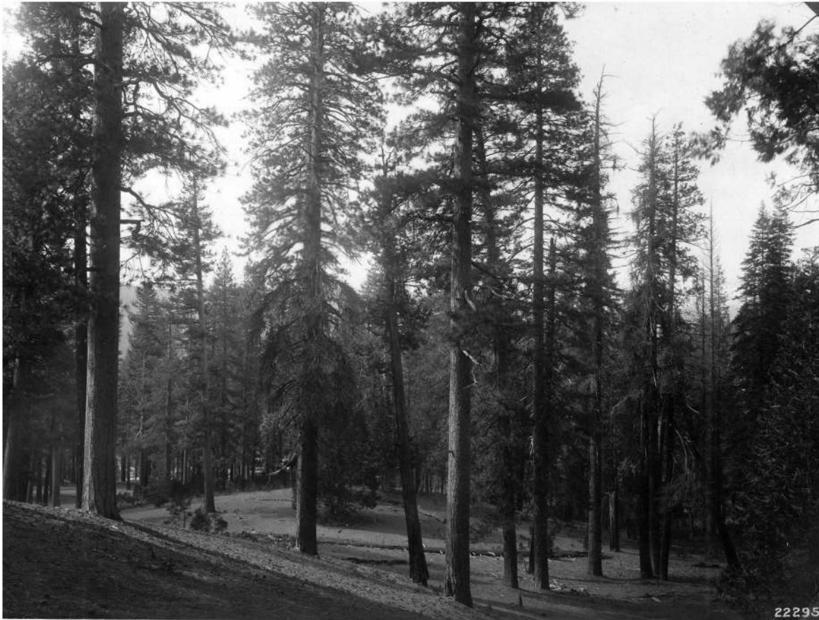
Fig. 1. Mixed conifer forest from Chiquito Basin on the Sierra National Forest. Original caption read, “Typed-Sugar Pine killed by Dendroctonus monticolae , Chiquito Basin. Taken by Dudley, 1914.”

of time between the reconstruction period and data collection, as there is with most historical forest reconstructions in the western US (>100 years), uncertainty increases owing to sample losses from fire, insects, disease, and decomposition (Collins et al. 2011).