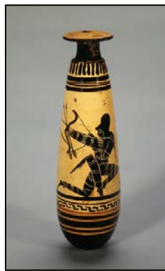
Figure 2. Amazon Archer

techniques require different posture for large-busted women, female chests are not shown to be prohibitive to archery participation in general. 31 This difference between the written history and the art work may be due to the Greek bias against these nomadic, equal women. It may indicate that some Greek historians such as Hellanikos believed that these women had to disfigure themselves, and become more masculine in appearance, in order to participate in fighting. This indicates how difficult it was for Greeks to comprehend female warrior's roles. The Greeks' strict gender roles limited women's abilities to pursue alternative roles, such as in hunting and warfighting.