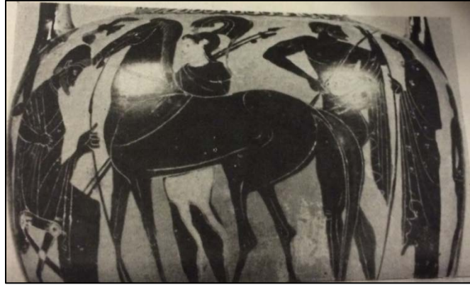
Figure 1. Penthesilea, Greeting a Seated King Priam in Her Quest to Defend Troy

Greek historian bias. Penthesilea's legend is one of many from antiquity that provide an important perspective on how women fought and hunted.