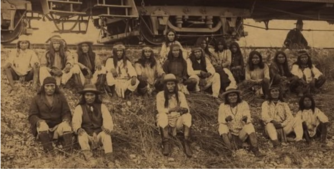
Figure 3. Apaches who Surrendered with Geronimo, September 1886