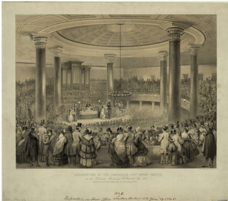
Figure 4. The interior of the Broadway Tabernacle, New York, NY, 1848.

leading exemplar of the Institutional Church Movement and seating at least 3,000 (and perhaps as many as 4,500) the church “combined the auditorium church form and multipurpose facility, enabling them to appeal to the urban elite while at the same time fulfilling a commitment, inherited from the revivalists, to promote moral reform and to evangelize the masses.” 31 The Temple boasted a college; one of the best-equipped gymnasiums in Philadelphia; a nearby cricket field and baseball diamond; an affiliated Hospital (to which the Sunday services were broadcast over special speaking tubes); a separate “Young People’s Church,” which met in the basement and could accommodate 2,000; a large banquet facility; and regular concerts, lectures, debates, and readings in its main sanctuary. 32 As Loveland and Wheeler note, “The church’s founder, Russel H. Cornwell, justified the Temple’s sponsorship of ‘entertainments’ on the grounds that the church should use ‘any reasonable means to influence men for good’.” 33