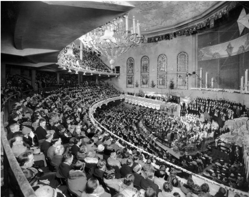
Figure 5. The interior of the Angelus Temple, Los Angeles, c. 1930.

And while more formal Gothic designs became more popular after WWI, Protestants continued to build large worship spaces that maximized the ability of participants to hear and see the drama unfolding on the stage. The Angelus Temple in Los Angeles, CA stands as perhaps the finest witness to the continuing attraction of the huge, multipurpose church to Protestants. The Temple housed prayer rooms, broadcast facilities and venues from which to run social-service agencies. The desire to reach the masses with the gospel message and to provide a mission outpost to influence the broader society stood behind the Temple’s founder Aimee Semple McPherson. 37 The sanctuary, built in 1923, is pictured in Figure 5. Angelus Temple continued one of the dominant forms of Protestant sanctuary design—a large, multi-galleried worship space to accommodate thousands that still maintains an intimate focus on the stage.