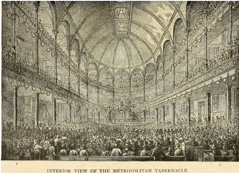
Figure 3. The interior of the Metropolitan Tabernacle, London, England, 1864. Reprinted from Charles Haddon Spurgeon's book The Metropolitan Tabernacle Pulpit (London, 1864). Public domain.

Bible Institute Monthly , held up Spurgeon's church as an important exemplar, a point to which I will return below.