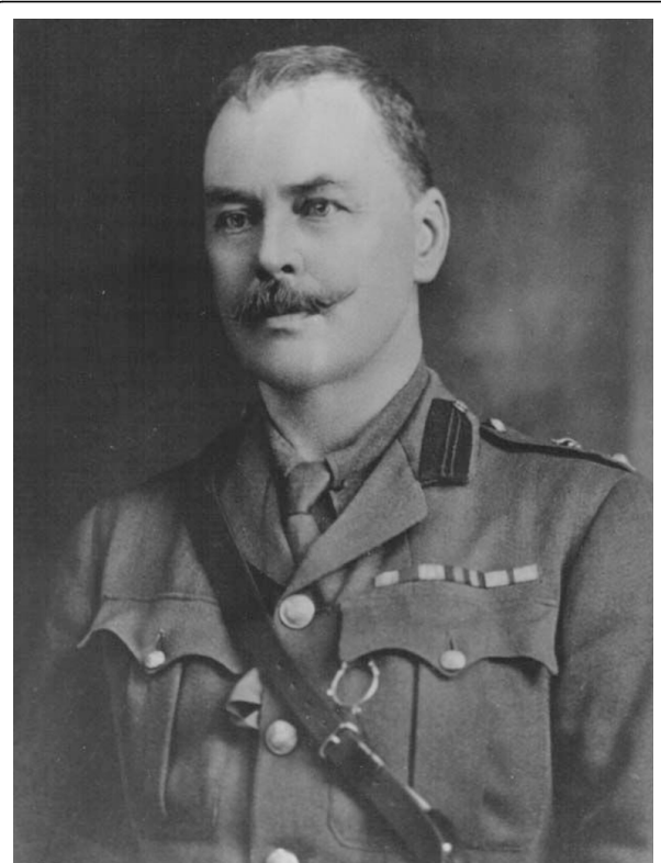
Figure 2 Ronald Ross 1857-1932. Portraits of other scientists who were involved in the elucidation of the life cycle of the malaria parasites can be found elsewhere [9,40].

Ronald Ross 1857-1932. In 1897 Ronald Ross working in India discovered that culicine mosquitoes transmitted the avian malaria parasite Plasmodium relictum and suggested that human malaria parasites might also