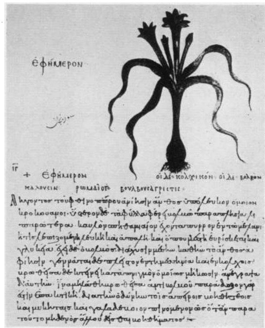
Fig. 3.—Ephemeron or Colchicum, from the Cheltenham Codex, Plate 48.