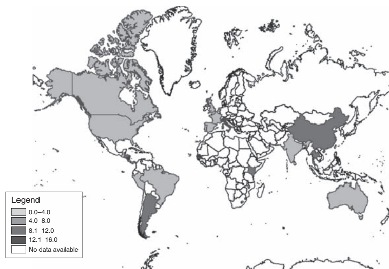
Fig. 1. HIV incidence per 100 person-years among men who have sex with men (MSM). Data are from Table 1. In the case of multiple incidence estimates per country, only data from the most recent study were included.

of MSM was estimated to be 8.2 per 100 person-years from 2008 to 2009. 45 In a cohort of 510 MSM in Lima, Peru, the HIV incidence was 4 cases per 100 person-years, further indicating high risk as compared with other adults. 36 Furthermore, a 2012 review of 55 studies among MSM in China found a dramatic 3.3-fold increase in HIV incidence among MSM from 2.04 to 7.02 per 1000 person-years during 2002–2010. 46