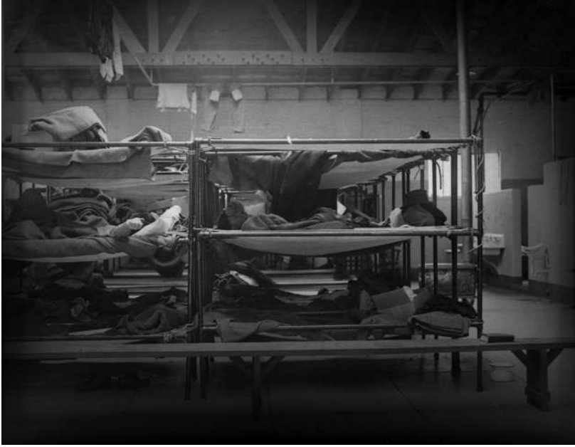
Figure 2. Overcrowding at the East Side Stockade (Lincoln Heights Jail), shown in “Men Sleeping in Bunks,” GPF 5664, Seaver Center for Western History Research, Natural History Museum of Los Angeles County.

closely resembled the state’s 1850 and 1860 Acts for the Government and Protection of Indians declared that “[a]ny Indian” who was “found loitering and strolling or frequenting public places where liquors are sold, vagging or leading an immoral or profligate course of life, who shall be found drunk or making a noise or disturbance, shall be liable to be arrested.” 73 Aggressive enforcement of such legislation kept the jails of Los Angeles crowded with California Indians and poor Mexican Americans.