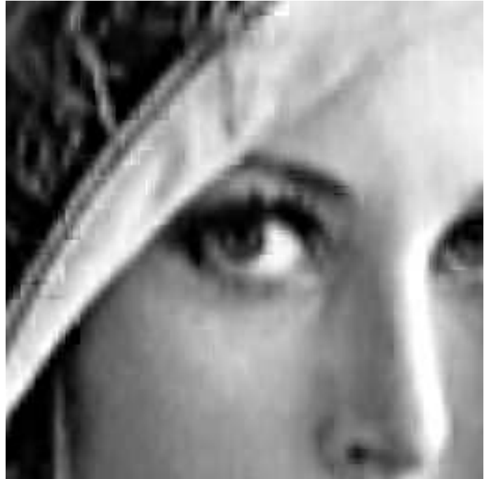
Fig. 2. 4 times interpolation on a detail of Lena: bicubic (up), regularity-based (bottom)