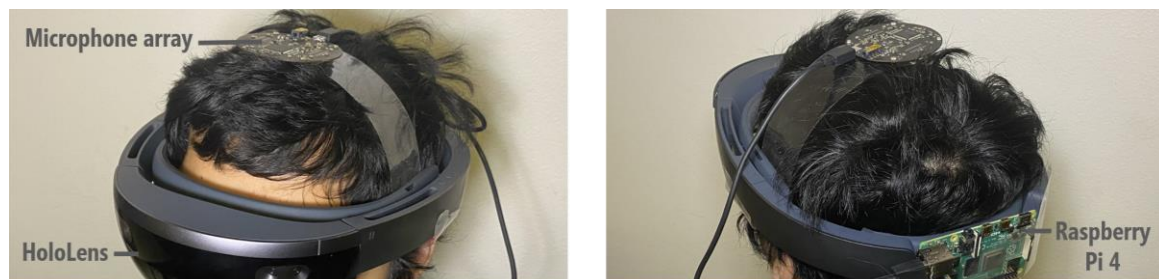
Figure 2: The three components of HoloSound system.

While not all DHH people want to use sound feedback technologies, past large-scale surveys with DHH people [3,4], show that many would find such technologies desirable and useful in everyday activities. HoloSound is informed by prior AR-based sound awareness work with DHH users [11,13,19], as well as personal (e.g., [12]) and research experiences (e.g., [15]) of one of our authors (Jain) who is hard of hearing. The system consists of two parts: an app running on the HoloLens and an external microphone array, ReSpeaker [20], retrofitted on top of the HoloLens (Figure 2). A cloud-based server is used to interface the portable microphone array with the HoloLens and to run the sound recognition engine. Figure 1 shows the preliminary user interface. Below, we detail the three key components of HoloSound, which are also demonstrated in the supplementary video. The system is open sourced on GitHub: https://git.io/JJaHe .