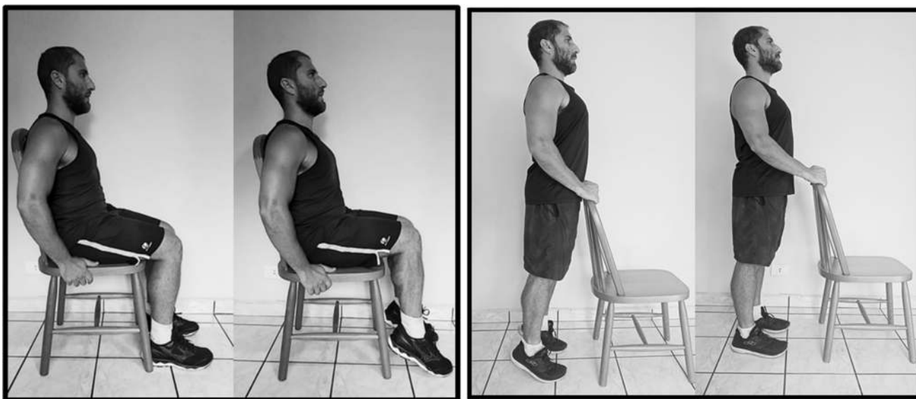
Fig. 5 Seated or stand calf

Both ITT and case-complete analyses showed that HB vs. CTRL improved 30-s sit-to-stand test performance ( p < 0.01 and p = 0.02 ) and predicted VO_2 ( p = 0.04 and p = 0.04 ) (Table 2).