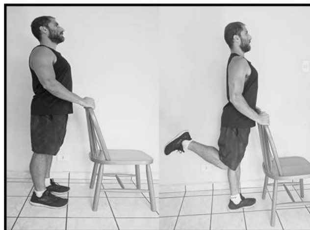
Fig. 6 Leg curl

and not available for assessments ( n = 1 )] and were excluded from the trial. Two additional patients (CTRL: n = 1 and HB: n = 1 ) were also excluded after randomization due to a delay between randomization and baseline data collection, exceeding the pre-specified post-surgery period limit (i.e.; < 12 months). None of these patients underwent baseline data collection and were excluded from the ITT analysis. Nineteen patients were lost to follow up (CTRL: n = 5 and HB = 14) but were included in ITT analysis (Figure S1). Patients' main characteristics are shown in Table 1.