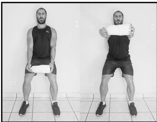
Fig. 4 Front raise

and not available for assessments ( n = 1 )] and were excluded from the trial. Two additional patients (CTRL: n = 1 and HB: n = 1 ) were also excluded after randomization due to a delay between randomization and baseline data collection, exceeding the pre-specified post-surgery period limit (i.e.; < 12 months). None of these patients underwent baseline data collection and were excluded from the ITT analysis. Nineteen patients were lost to follow up (CTRL: n = 5 and HB = 14) but were included in ITT analysis (Figure S1). Patients' main characteristics are shown in Table 1.