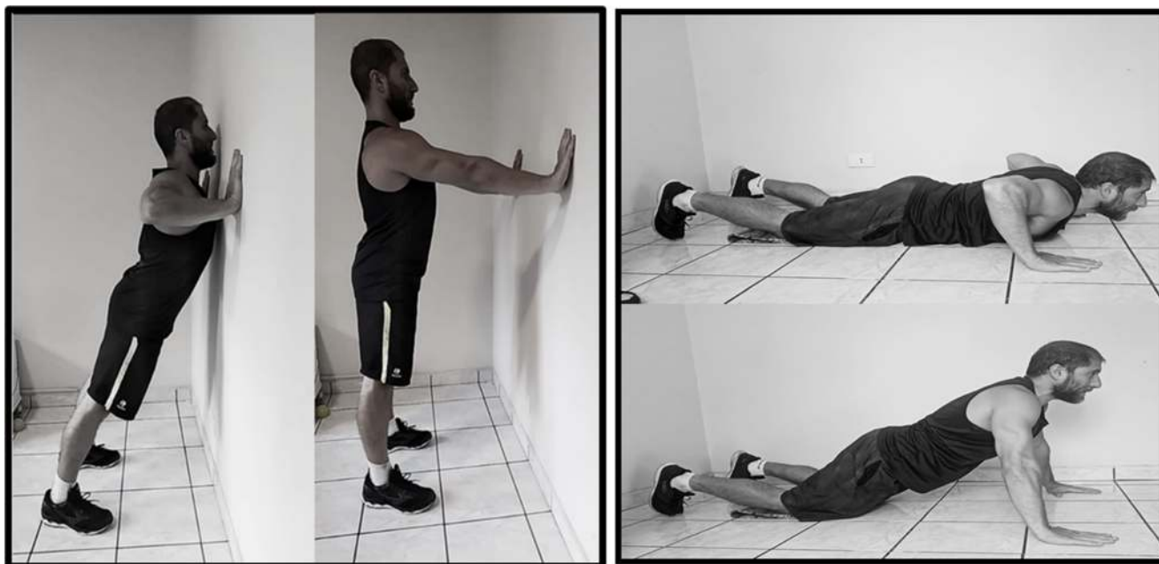
Fig. 1 Wall or floor push-up

Seventy-six patients were randomized. Among them, 5 (13.5%) and 7 (21.2%) in CTRL and HB, respectively, were only remotely assessed as they lived outside the city. Four patients from HB withdrew their consents before baseline data collection [severe depressive symptoms ( n = 1 ), not available for training program ( n = 2 ),