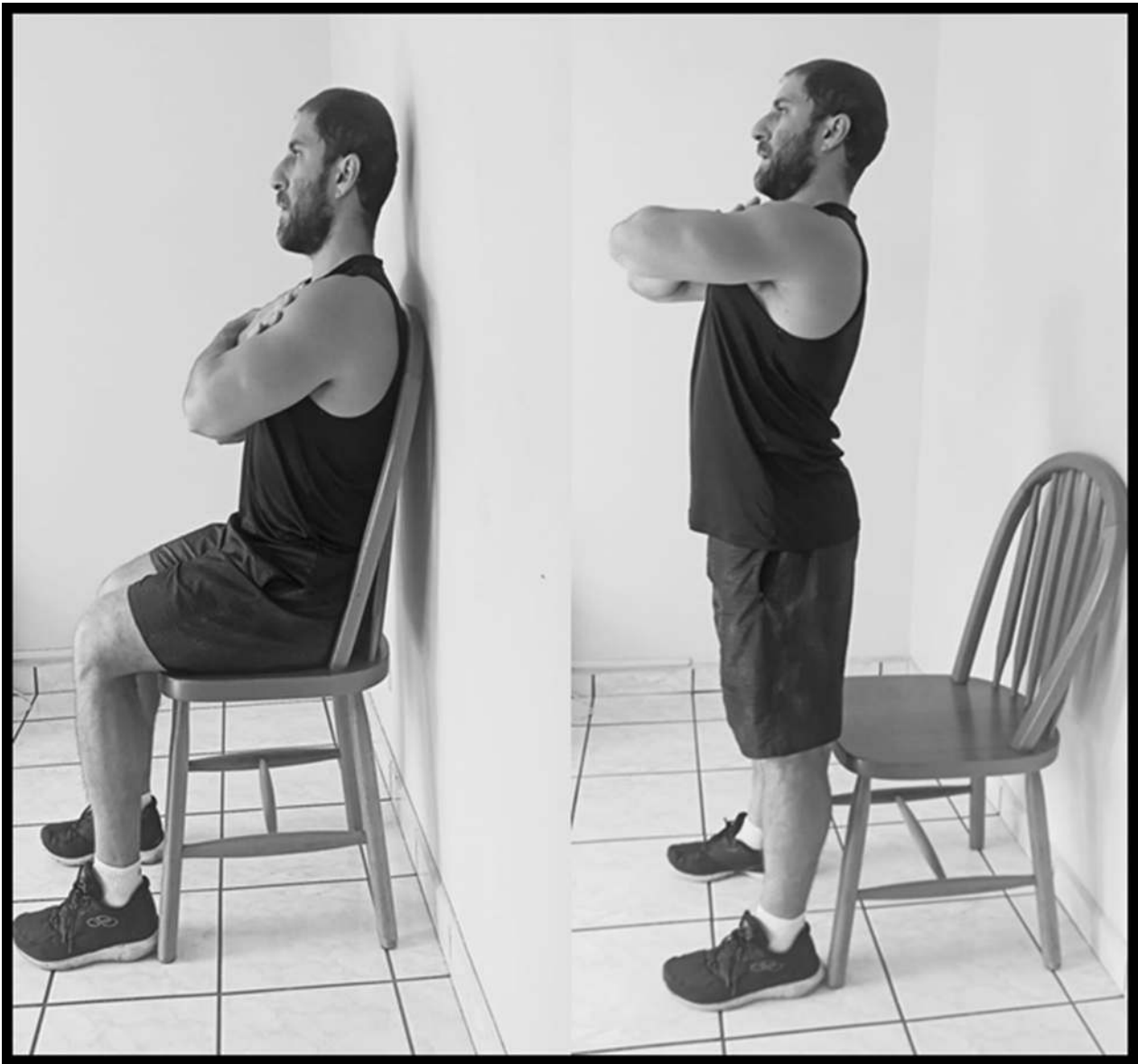
Fig. 2 Sit-to-Stand