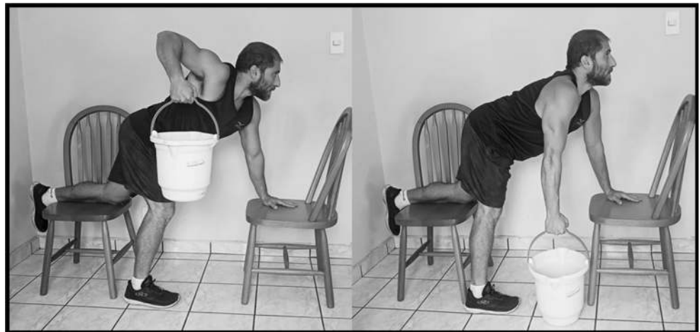
Fig. 3 Unilateral rowing