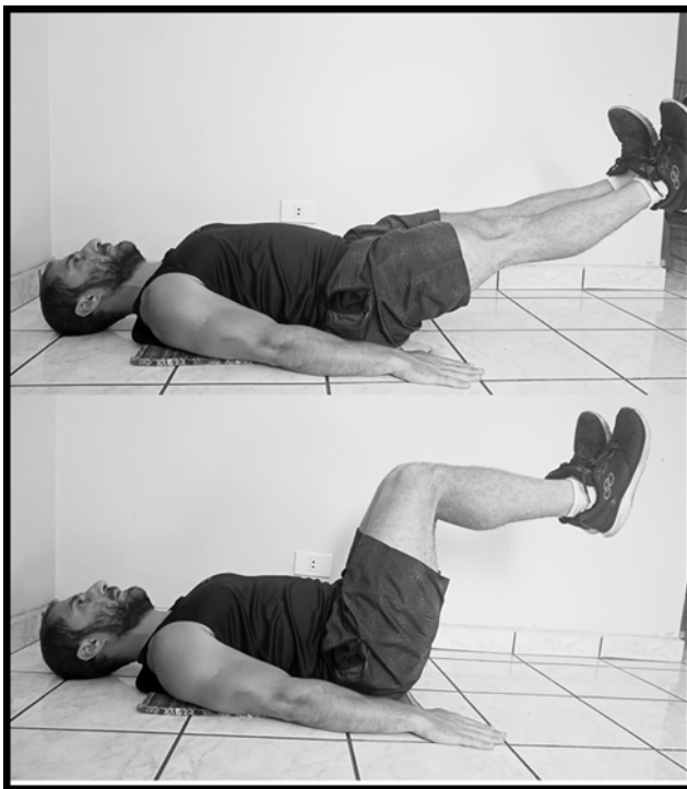
Fig. 7 Abdominal

Home-based exercise has emerged as an alternative tool to delivery physical activity to self-isolated individuals due to COVID-19 outbreak. However, the viability and efficacy of this intervention remain underexplored. Recently, we showed that patients who had bariatric surgery have experienced cardiometabolic disturbances, poor quality of life, and inactivity during pandemic [2]. This trial tested whether such a poor condition could be lessened by a home-based exercise program.