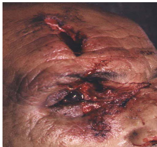
Figure 1. Typical stellate shaped entry wound showing tattooing effect

Examination of the victims of firearm injuries need to ascertain the characteristics of entry wound such as muzzle imprint, burning (flame effect), smudging (the smoke effect), tattooing or stippling and the collar of abrasion (only in rifled weapons). The exit wound will not show these characteristics, except the everted margins of different sizes.