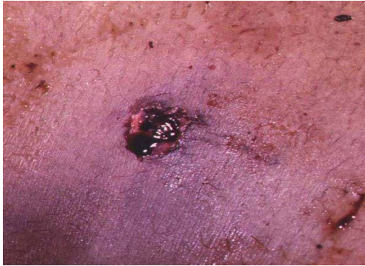
Figure 2. An entry wound with visible shining projectile