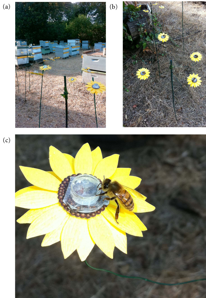
Figure 1. Experimental apiary and artificial flower arrays. (a) Apiary with an artificial flower array arranged in the shade, 1–2 meters from hives. (b) Experimental flower stand on which honey bees can be seen feeding from flowers containing synthetic nectar inoculated with microbes. Each treatment was represented once on each stand. (c) Experimental flower showing a honey bee feeding on synthetic nectar. doi:10.1371/journal.pone.0086494.g001

Immediately after removal from the containers, the live bees were placed in a 4°C refrigerator for 3 minutes to slow movement. The bees were then dissected transversely to detach the sting, open the posterior segment of the abdomen, and remove the fully intact intestine containing the gut. Within the gut we sampled the crop, a central organ in the honeybee's food production, located between