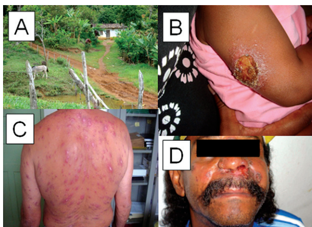
Fig. 1: the study area and spectrum of clinical disease caused by Leishmania braziliensis infection in Corte de Pedra, state of Bahia, Brazil. A: typical house and farm area; B: typical cutaneous leishmaniasis lesion characterised by granulomatous background and elevated borders; C: disseminated leishmaniasis, a form of disease that is increasing in the study area; D: mucosal leishmaniasis characterised by infiltrated ulcers that can cause extensive destruction of the nasal septum, columella and the upper lip.

The endemic site of Corte de Pedra - Corte de Pedra, a village located in the southwestern region of BA, belongs to the municipality of Presidente Tancredo Neves, whose population is approximately 17,928 inhabitants (source: Brazilian Institute of Geography and Statistics). The endemic area of Corte de Pedra, however, extends far beyond the village, covering 20 municipalities in a total area of approximately 9,935 km 2 around the site where a Health Post was established in 1980s as a reference centre for the treatment of leishmaniasis in the region. Currently, 430,347 people are distributed across these towns, for which the main economic activity is subsistence farming, particularly the cultivation of cocoa, cloves, guarana, banana, coffee, black pepper and rubber. The endemic area of Corte de Pedra is typically an area of rainforest that over the years has been reduced to isolated areas of secondary forest with agricultural activities providing the main source of income for the majority of its inhabitants. The occupational and domestic habits of these individuals, which involve work on farms and homes built in clearings in the woods, have increased the population's exposure to L. braziliensis infection. From 2007-2012, 7,093 cases of ACL were recorded in the region, with 6,747 (95%) cases of CL, 138 (2%) cases of ML and 208 cases (3%) cases of DL.