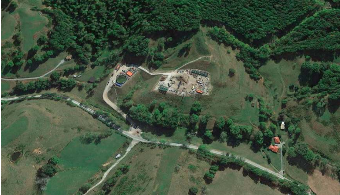
Figure 3. Well pad proximity to houses in northwestern West Virginia. In this photo, the well pad is approximately 650 feet from the house on the left, and 750 feet from the house on the right. Google Earth. 2 June 2019.

unregulated [65], as the US Environmental Protection Agency (USEPA) does not regulate private water wells [66]. According to estimates by the Water Use Section of the West Virginia Department of Environmental Protection (WVDEP), in the eight northwestern counties where this research took place, there are about 150 thousand residents relying on groundwater [67].