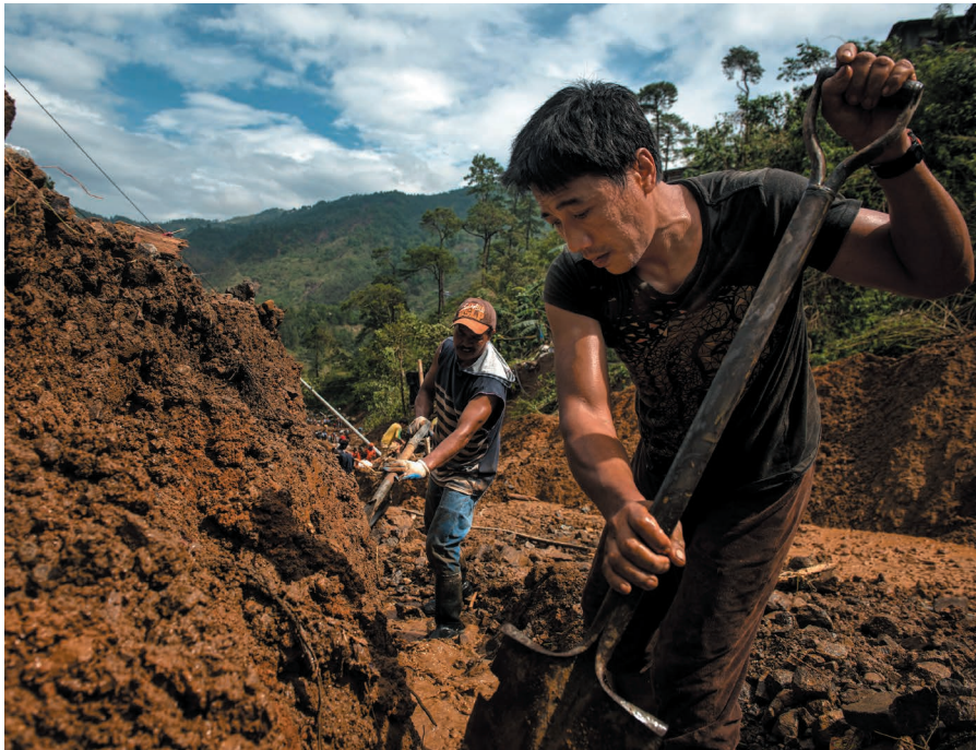
A search for survivors after Typhoon Mangkhut triggered a landslide last week in Itoyon, the Philippines.

and infrastructure such as barriers and protections. The state of the coasts, in turn, dictates communities' exposure.