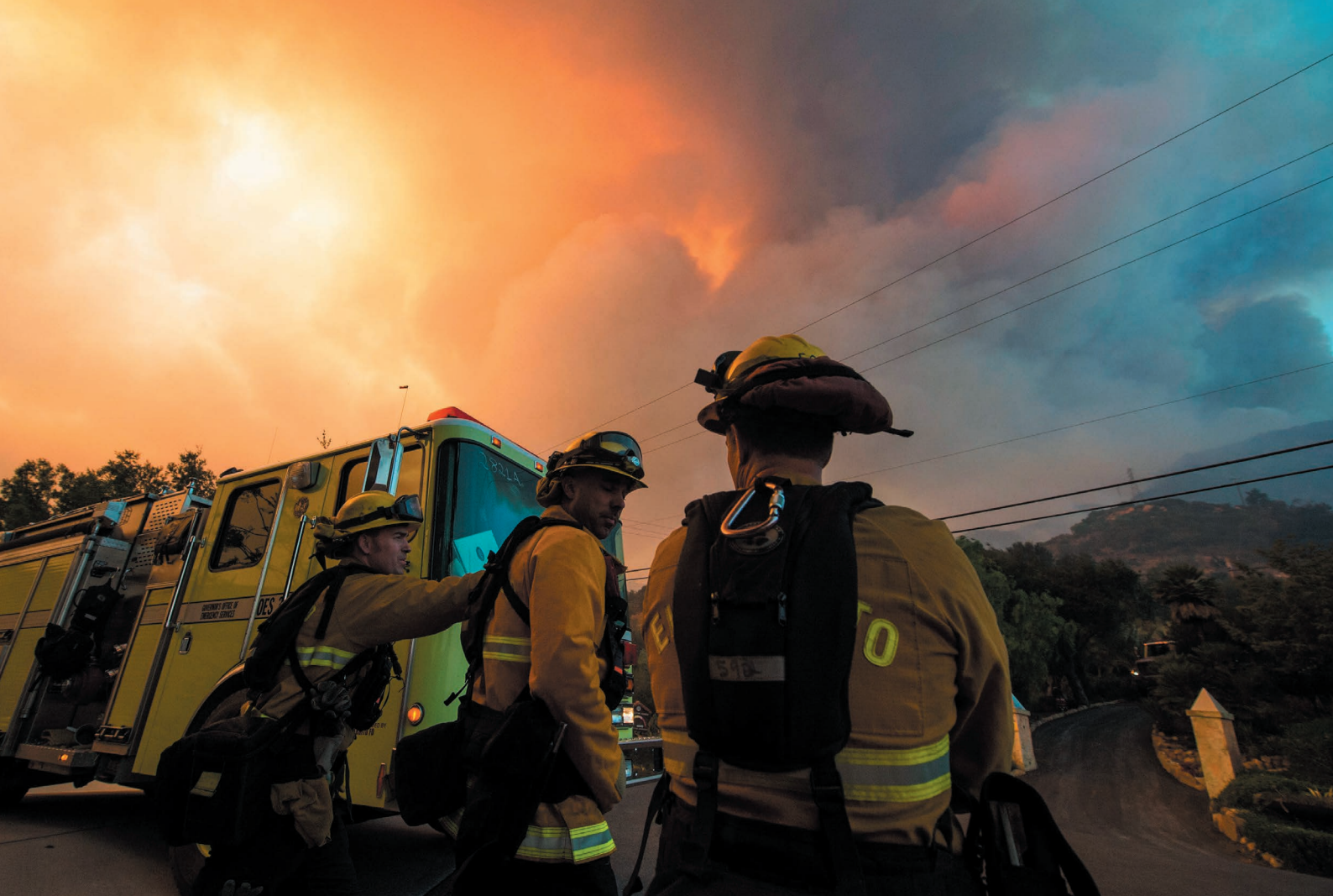
A wildfire in Montecito, California, in December 2017. The following month, heavy rain falling on the burnt slopes caused a mudslide that killed 21 people.