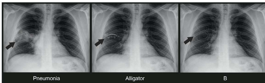
Figure 1. A trio of chest X-ray images with pairing of a lesion, an animal, and a letter*. *Arrows pointing to targets in the image; not present in the original images.

An important finding was that radiologists were able to cogitate differential diagnoses during the 3.5 seconds of a trial. A similar awareness of alternative names of other animals was reported while naming animals. In a few cases even letters evoked words to subjects (Table 1). Participants were not instructed to make differential diagnoses or to think about alternative names for animals during the task. These results are compatible with a fast and automatic semantic association process, in which the recall of a diagnosis or a name of an animal occurs with the concomitant activation of semantically related concepts [16,17,18]. Clearly, a formal and definitive diagnosis can not be made in seconds but its core cognitive process, the generation of diagnostic hypotheses which were the names of lesions in our study, is crucial for a final correct diagnosis [4,5,6,7,8].