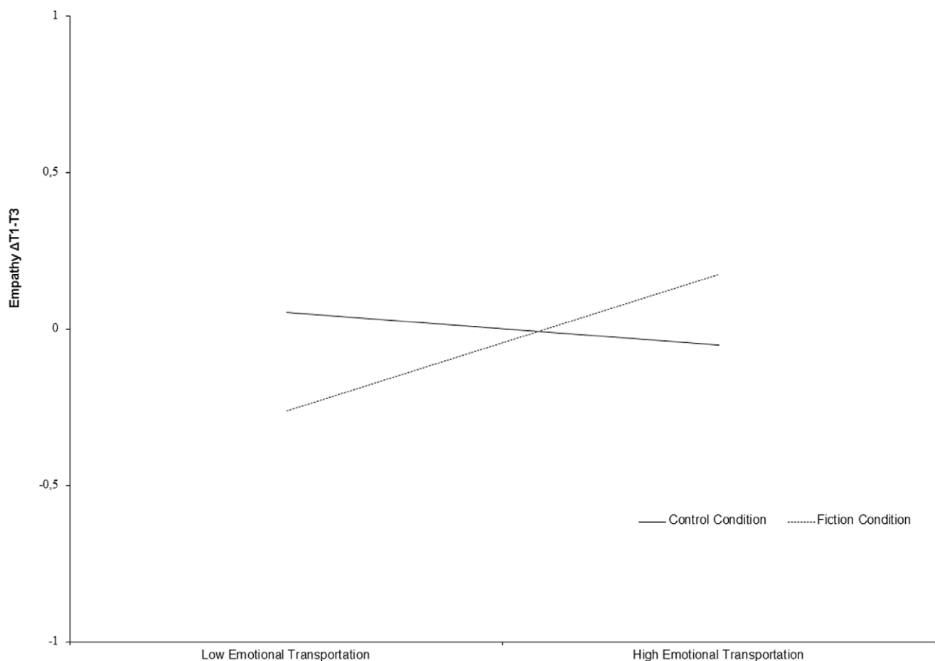
Figure 1. The interaction pattern between emotional transportation and condition in relation to changes in empathy from T1 to T3 (Study 1).

Handelsblad (control condition). After reading the text, they filled out the emotional transportation measure as well as the narrative understanding and attentional focus measures, the empathy scale, and some other irrelevant scales, such as engagement in leisure activities, attitudes about work and creativity, in order to avoid demand characteristics (T2). Furthermore, participants were asked to give a summary of what they had read. The first author and two colleagues assessed whether participants gave accurate summaries. Since all of the participants provided accurate summaries, none of