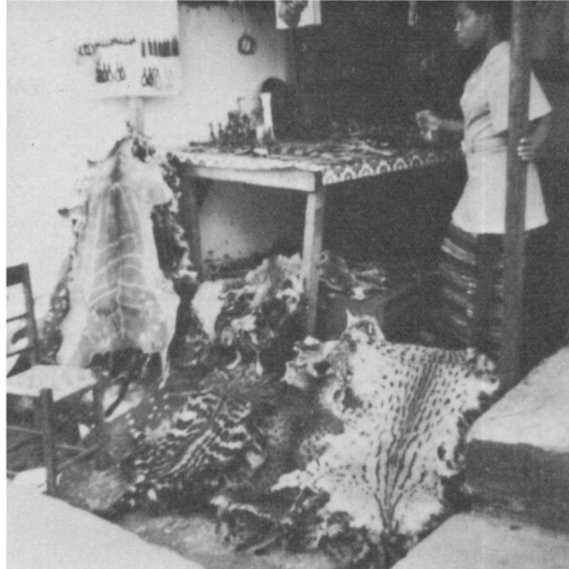
SKINS for sale in a Monrovia shop

Leone; none were Liberians. Because these countries have tightly regulated currencies and Liberians are allowed to deal in US dollars, Monrovia has become a clearing house for the ivory trade. The manufacture and sale of African art requires a $100-a-year licence. Current ones were seen displayed in two shops.