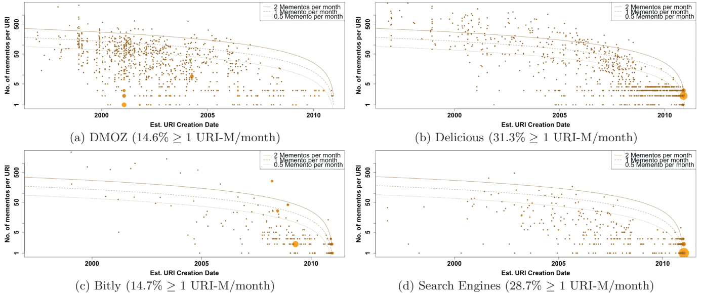
Figure 2: The relation between the Mementos' density and the URI's age in months.

Table 5 shows retrieved memento statistics. For each sample source, we show the number of mementos (URI-M) discovered, the number of URIs (URI-R) that have mementos, the mean number of mementos, and standard deviation.