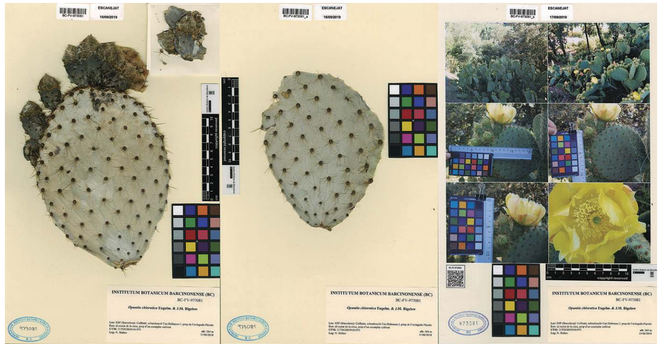
Fig. 2. Fusion voucher of Opuntia chlorotica Engelm. & J.M. Bigelow (BC-FV-973081) in Collbató (Catalonia, Spain). This species is identified by the colour of the style and stigma, a character that is lost when the flower is dried. Moreover, Opuntia samples are difficult to dry because of the presence of spines.

herbarium sheet or in an equivalent preparation, such as a box, packet, jar, or microscope slide.” However, difficulties in getting herbarium specimens under certain circumstances is a problem that botanists face more and more frequently, and the possibility of making a photo voucher in these cases should be taken into account.