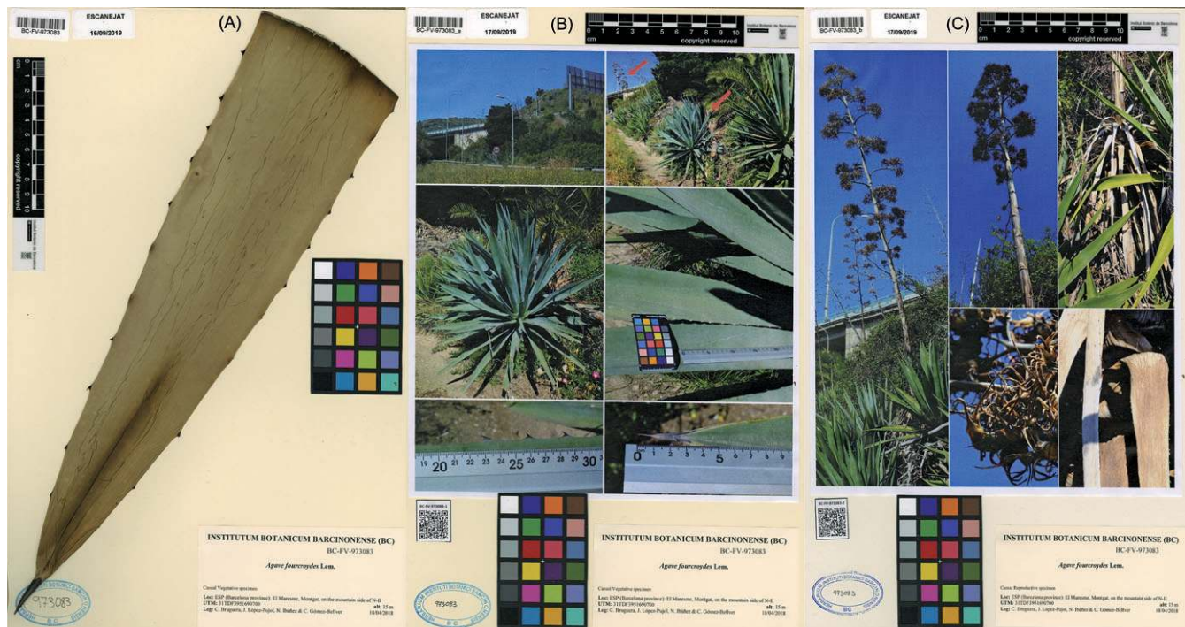
Fig. 1. Fusion voucher of Agave fourcroydes Lem. (BC-FV-973083) from Montgat, near Barcelona City (Catalonia, Spain). This voucher includes both photographs and parts of the plant, and it is composed of three sheets: one (A) is the terminal part of a leaf, the second (B) is a series of pictures of the vegetative individual (from which the leaf was taken), and the third one (C) includes pictures of a flowering individual from the same population. We recommend, when possible, to include a picture in which the two specimens (vegetative and reproductive) are shown. In order to identify both specimens, red arrows are included in one of the photographs of the habitat.

Mill.). In these cases, photographs of the aspect of the plant before drying are a good complement to the physical specimen, which can be limited to a small part of the plant easy to carry and press (such as a small leaf portion or the terminal spine; Fig. 1).