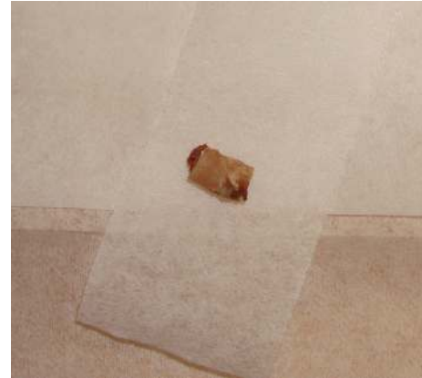
FIGURE 3: Excised bone cylinders using the surgical stent.

2.1.4. Micro-CT Imaging. As a part of the pilot study, the bone cylinder on the left first premolar molar region of human cadaver bone was randomly chosen for micro-CT scanning. The bone cylinder was placed in a custom vessel