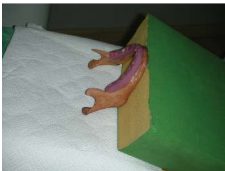
FIGURE 2: The surgical guide which was fabricated on the cast obtained from an impression of the alveolar process of the mandible.

satisfy continuum assumption, so that mechanical properties derived for each cylinder was representative of the whole bone [34].