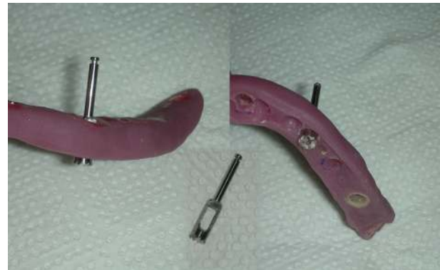
FIGURE 4: Excision of bone cylinders from the mandibular body using a slow speed trephine drill.

wrapped in paper soaked with saline solution to prevent any desiccation, and isotropically scanned at 14\mu\text{m} resolution with a model 1172 micro-CT scanner (Skyscan, Kontich, Belgium) using a CBCT scanning technique (Figure 5). CBCT is a novel CT image acquisition technique in which up to a several hundred CT images (as opposed to 1–3 images in normal CT) are reconstructed by one data acquisition as the data on the fluoroscopic image is handled as plane data. The total time required for scanning and reconstruction was approximately 30 minutes per sample, thus deterioration of the bone cylinder as a result of being exposed to ambient conditions was significantly reduced. To ensure a consistent CT image resolution among all the datasets, the scanner turntable location was fixed at a specific SOD and SID distance of 19.03 mm and 356.90 mm, respectively. The X-ray parameters were set at 51 kV and 200\mu\text{A} and the CT images were processed at a scaling coefficient of 50 and averaged three times. With these parameters, together with a 0.5 mm aluminum plate placed at the X-ray detector, a good contrast was achieved in the resultant CT images between trabeculae. Resultant dataset had an isotropic resolution of 14.836\mu\text{m} . Resultant CT images for each bone cylinder was evaluated for microarchitectural parameters