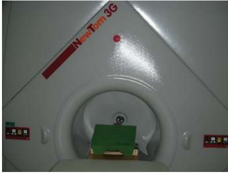
FIGURE 1: Newtom cone beam 3D imaging equipment.