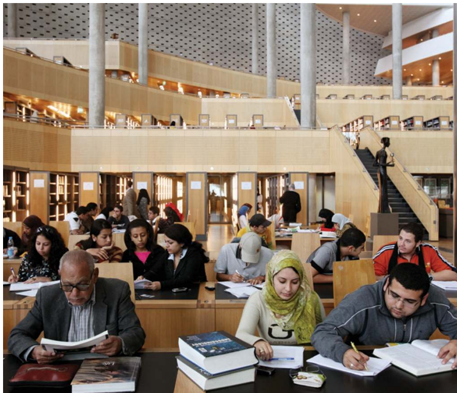
Egypt's Library of Alexandria is supervising the spread of online science courses in Africa.

In 2013, a single Research State Agency is due to launch, streamlining funding allocations. We must make scientific careers in Spain more attractive — through better contracts, improved recognition and more provision for researcher mobility. And we must support translational research, so that the benefits of Spanish science flow to society.