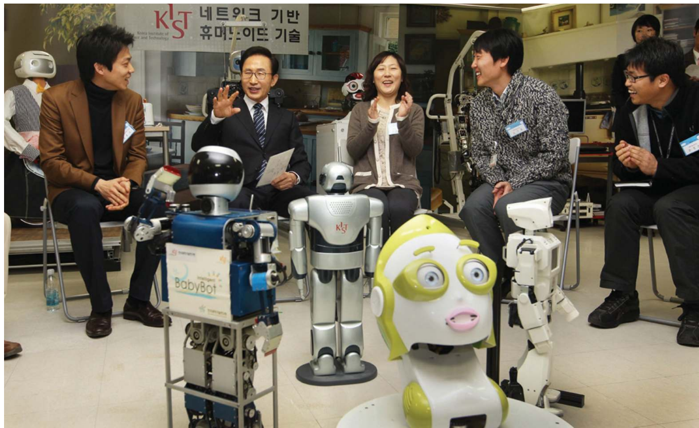
South Korean President Lee Myung-bak (second from left) talks to young scientists at the Korea Institute of Science and Technology in Seoul.