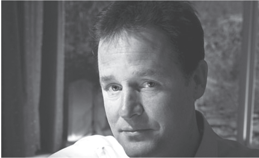
Figure 9 Nick Clegg relaxed