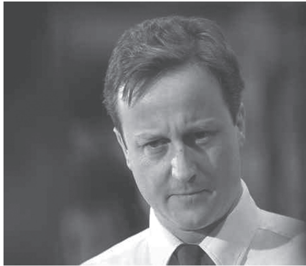
Figure 8 David Cameron ( The Daily Mirror , 16 April 2010)

Looking off frame also has meaning potential. When we see a person in an image looking off frame rather than at an object in the image, we are invited to imagine what they are thinking.