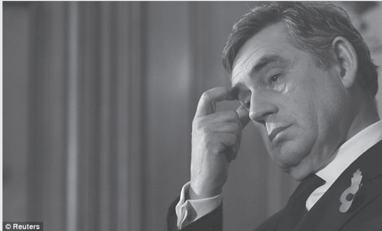
Figure 7 Gordon Brown vulnerable ( The Daily Mail , 11 November 2009)

Gordon Brown spoke of his personal grief at losing a child as he responded to criticism of his handwritten letter of condolence to a dead soldier's mother.