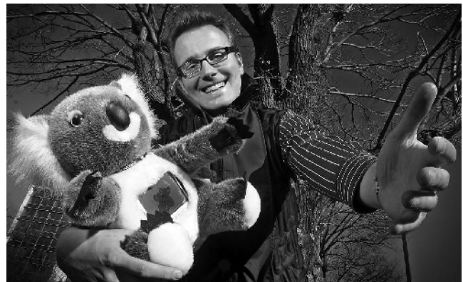
Figure 1. Rubbing the koala sends a wireless Hug over a Distance executed through the vest.

Task-oriented technology, such as email, videoconferencing and mobile phone voice and text communications were initially invented to increase efficiency in communication and collaboration. However, people often adapt them to satisfy their needs for social interaction: Flirting, chatting or finding marriage partners with these technologies are all lucrative businesses today, even though the initial designers surely did not envision such uses.