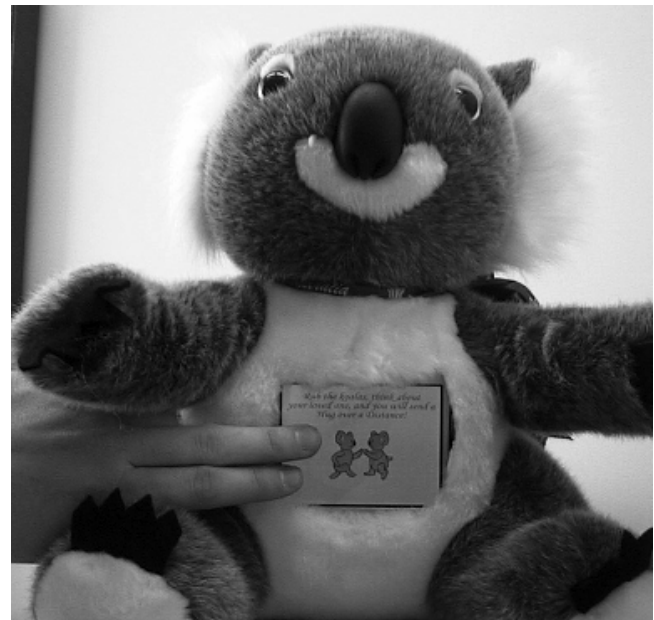
Figure 2. The wireless koala is currently a placeholder for a second vest.

It is important for us to emphasize that our intention is not to recreate accurately the physical and emotional experience of a real hug. Rather, we want to demonstrate, using a piece of wearable computing, that it is possible to send an “emotional ping” to a remote loved one with a tactile and unobtrusive interface. We are referring to a “hug”, because the feeling of light pressure around the body, combined with the associated warmth it creates, most closely resembles a hug.