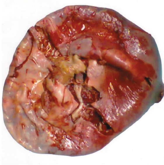
Fig. 1: Splenic cyst after operation

day without any complication. On subsequent follow up for one year patient was completely well both physically and mentally (Fig-2). Histopathologically it was a false cyst of degenerative origin.