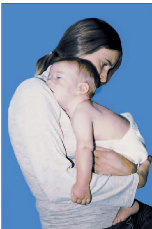
Figure 1. Three-Month-Old Patient with Mild Infant Botulism.

The study population for the randomized trial consisted of all infants admitted to hospitals in Cali-