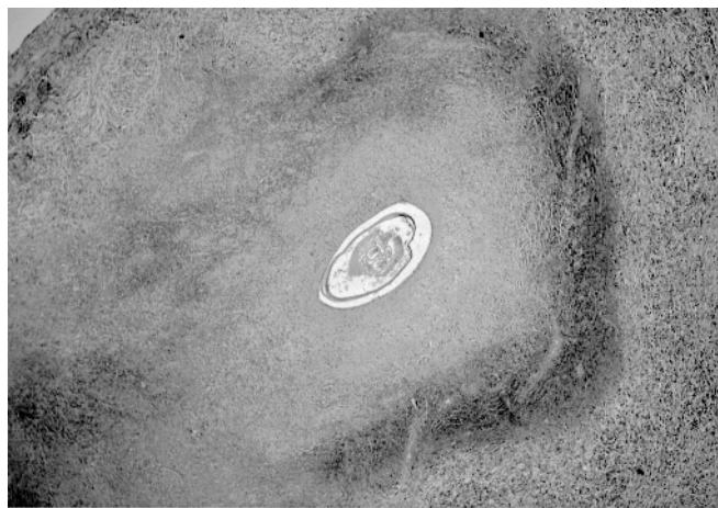
Fig. 1. Overall histological view of the nodule in the middle of which an oblique section of the nematode is visible (HE, \times 36 )

On the basis of the morphological features the nematode was identified as a not gravid mature female of Dirofilaria (Nochtiella) repens .