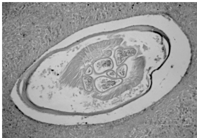
Fig. 2. A transverse section of the nematode showing six sections of the genital tube and one of the intestine. The myoid fibres are strongly altered by regressive phenomena, the lateral chords are partially disintegrated (HE, \times 150 )