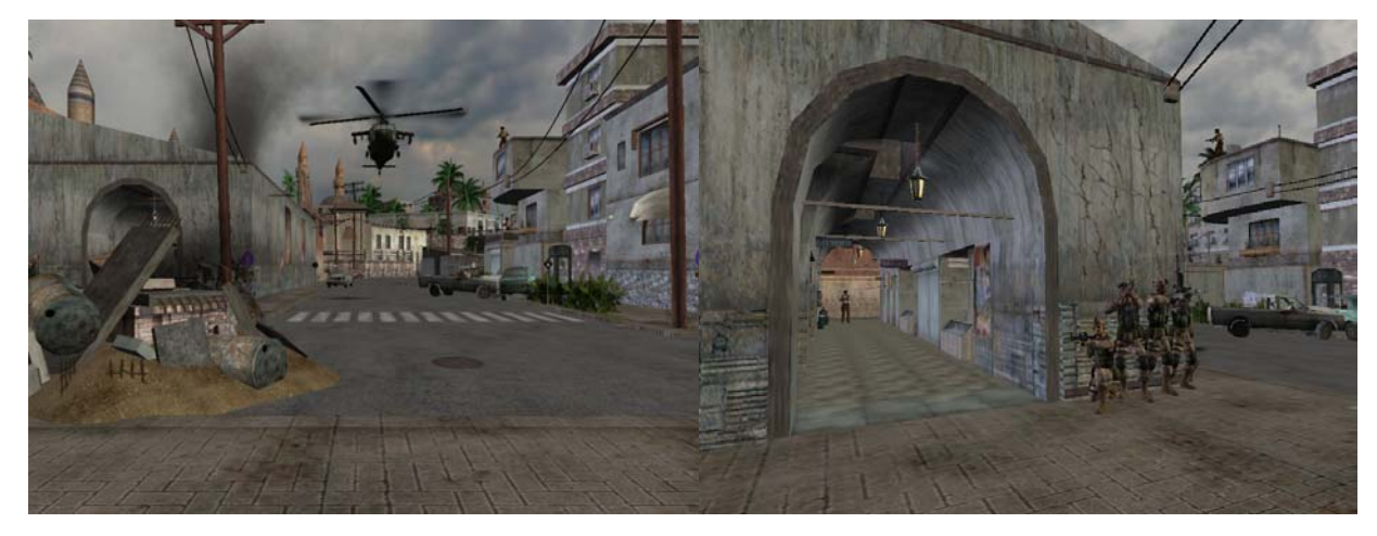
Figure 3. City View