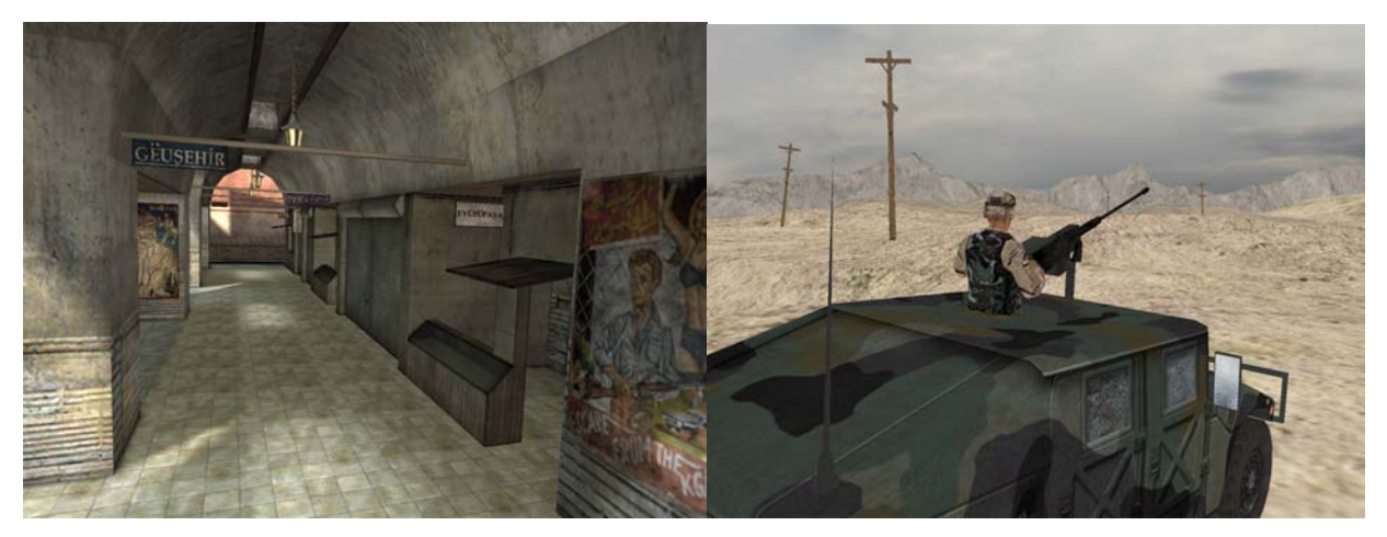
Figure 5. Interior View