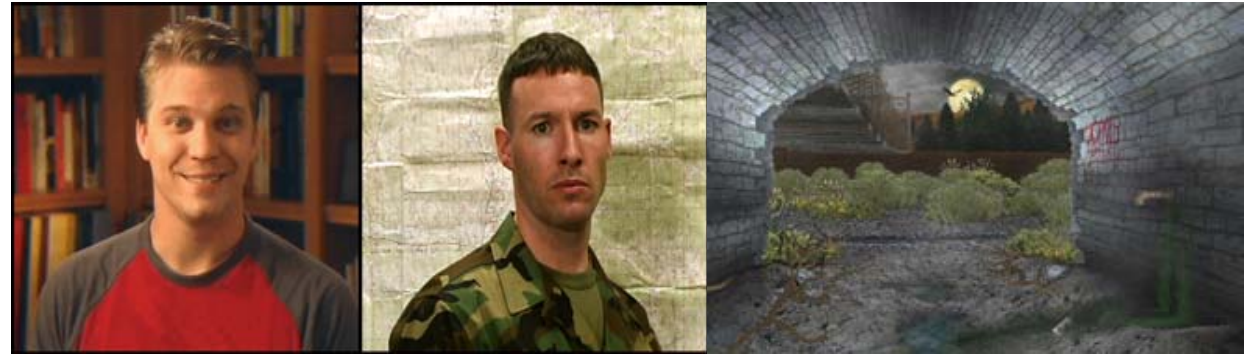
Figure 1: Priming is delivered by themed characters