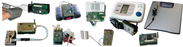
Figure 1. Sample of supported sensors.

Standard interfaces wrap sensor types and expose metadata, easing extension to new devices and applications. This lets sensor drivers recursively use SenQ to issue local or remote queries in complex ways, transparently to other users. For example, a doctor may create a virtual Fall sensor for a body network, that combines limb acceleration, body position, and pulse rate changes to detect whether the wearer has fallen, and gauge the severity of the event.