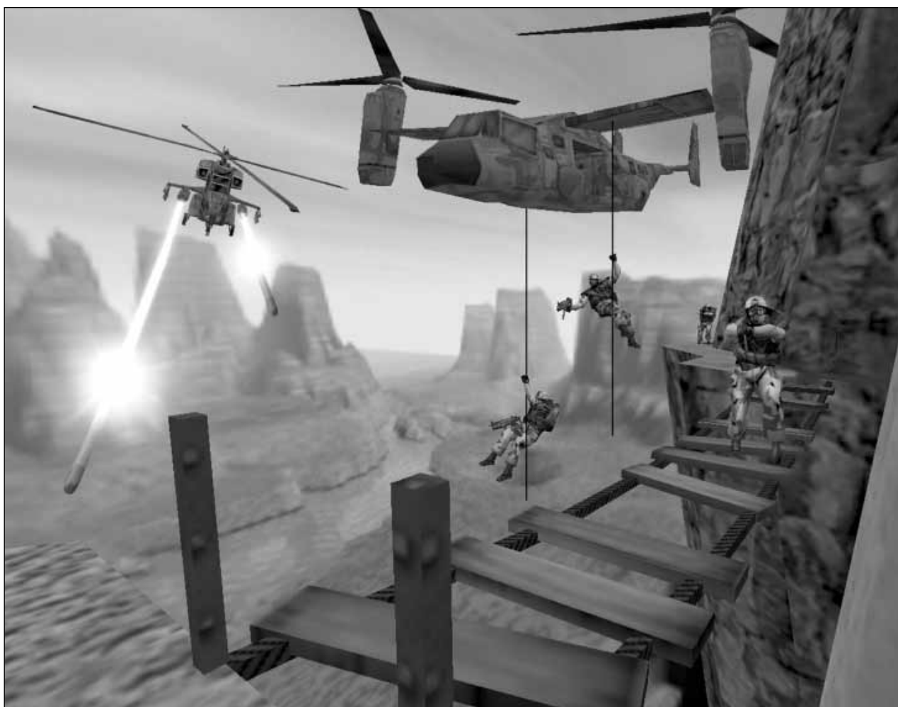
Figure 2. A Screenshot from the Popular Action Game Half-Life from Valve.