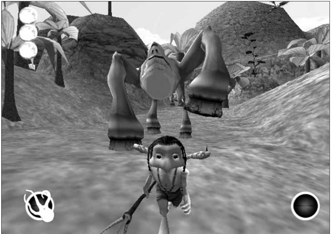
Figure 3. A Screenshot from the Upcoming Adventure Game Rubu Tribe by Outrage Entertainment.

massively multiplayer games provide an additional opportunity to use AI to expand and enhance the player-to-player social interactions, perhaps with AI-controlled kings who war by sending player-controlled knights to battle each other.