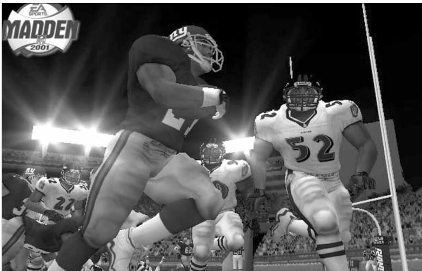
Figure 5. A Team Composed of AI-Controlled Players in Madden NFL™ 2000 Football. (Reproduced with permission from Electronic Arts Inc.)

extended geography of the environment, they must navigate and use path planning, spatial reasoning, and temporal reasoning. As the games become more complex, the enemies will need to plan, counterplan, and adapt to the strategies and tactics of their enemies, using plan recognition, opponent modeling techniques, and learning. Their responses need to be within the range of humans in terms of reaction times and realistic movement. One can even imagine adding basic models of emotions, where the enemies get “mad,” get “frustrated,” and change their behavior as a result.