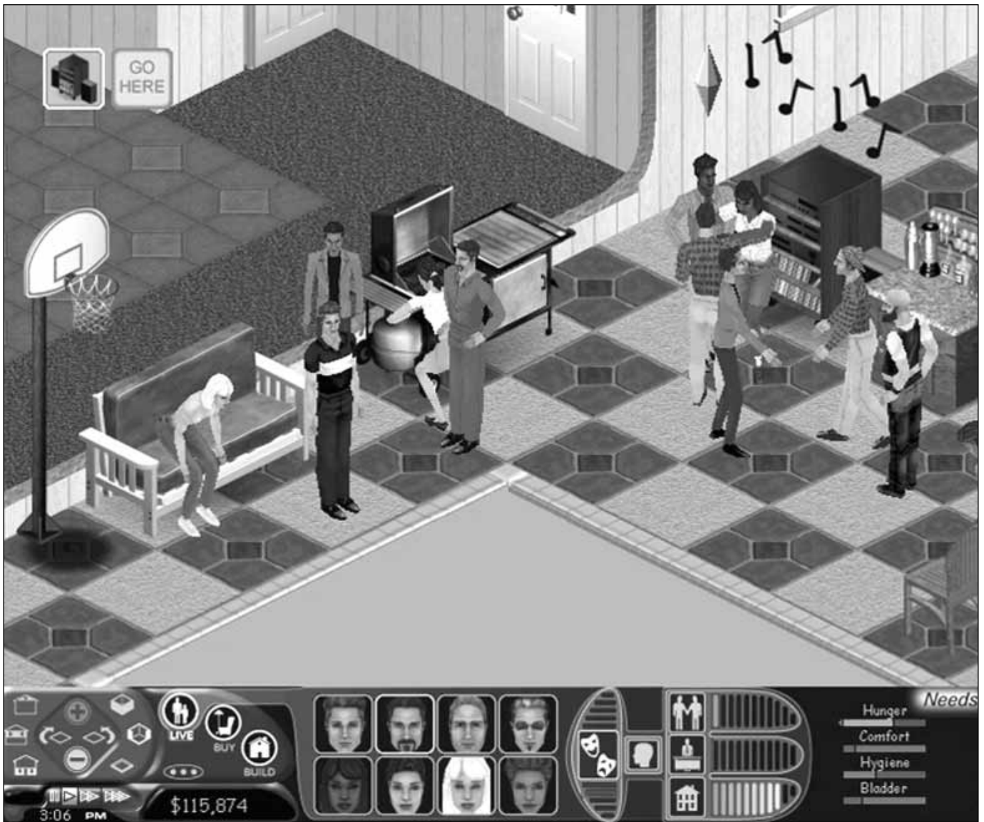
Figure 4. AI Characters, Called Sims, in the God Game The Sims.