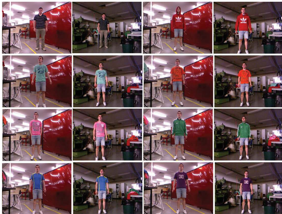
Figure 5. The shirts and lighting used for the recognition experiment

To test the robustness of the selected confidence threshold T_m in Equation 9, the shirt recognition method was tested in an environment with different lighting conditions to which the confidence threshold was obtained. The environment for the shirt recognition experiment was indoors with fluorescent lighting (Figure 5). 8 new shirts different from the ones used for the threshold calibration were used in this experiment. The new shirts were black with white stripes, bright red with a white logo, aqua with a blue pattern, bright orange with a grey pattern, bright pink with a grey pattern, green with white highlights, blue with yellow highlights and purple with a pink logo (shown in Figure 5). These shirts provided a wide coverage of the colour gamut and possible geometric patterns.