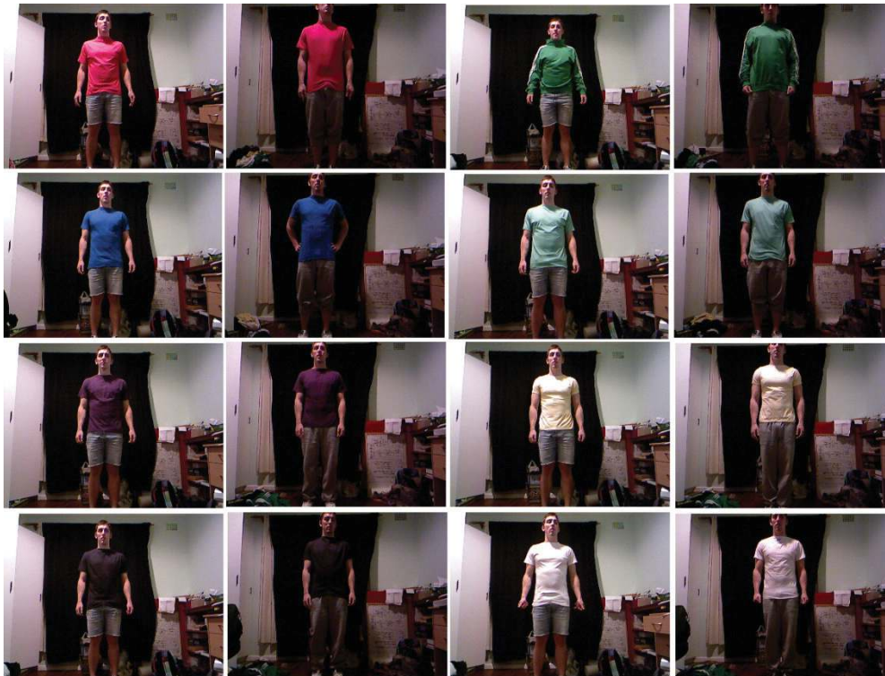
Figure 3. The shirts and lightings used to obtain the confidence ruling threshold.

where T_m is the confidence threshold that needs to be obtained for reliable shirt recognition. To obtain T_m , firstly the weighting factor W in Equation 5 needs to be chosen. In this paper, W was chosen to be 2 (giving the confidence range to be 0 to 6). This weighting factor value is more reliant on dominant colours than non-dominant colours. To obtain the T_m for differentiating a match from a non-match, the numerical analysis of sample extracted feature vectors is performed. In this paper, it is done by obtaining 100 feature vectors for each of 8 different shirts in two lighting conditions of approximately 50 and 35 lux indoors with incandescent lighting. Multiple feature vectors for each shirt are obtained and averaged so that a more reliable threshold can be established. All the shirts used are plain and in the following colours: red, green, blue, cyan, magenta, yellow, black and white, as shown in Figure 3.