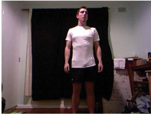
Figure 4. The shirt segmentation experiment setup

images were then converted to greyscale images and the accumulated histogram of these greyscaled images was calculated. The histogram was analysed to determine what clusters belonged to the background, shadows on the shirt and fully illuminated shirt. From analysis of the histogram, a greyscale threshold was obtained so that the shadows on the shirt and the fully illuminated pixels could be counted as good (belonging to the shirt) while the background pixels could be counted as bad during the experiments.