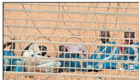
Migrants stranded at Israel's fenced border with Egypt.