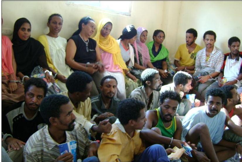
People chained in detention centre/prison in Egypt, waiting for their deportation, © Alganesh Fessaha, Gandhi Foundation