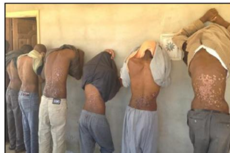
Eritrean refugees show their torture wounds.