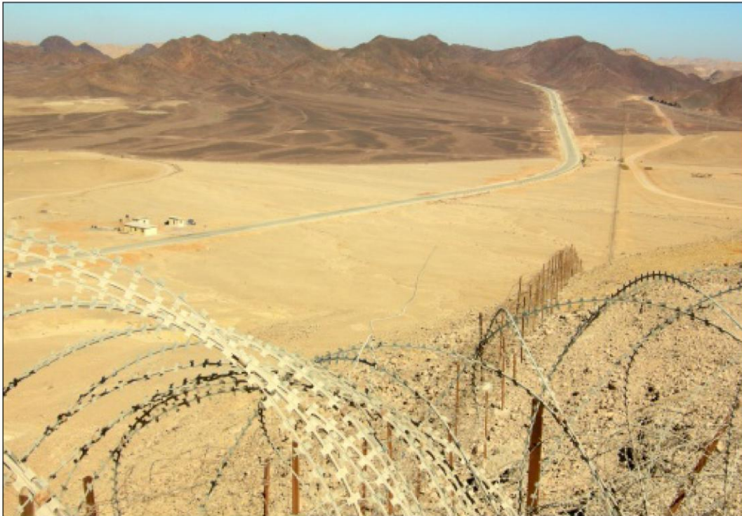
Barbed wire fences like this one line some segments of the Egypt-Israeli border on the Sinai Peninsula.