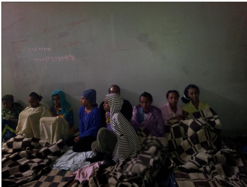
Police centre in Egypt