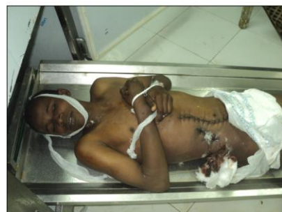
Organs removed, © Alganesh Fessaha, Gandhi Foundation