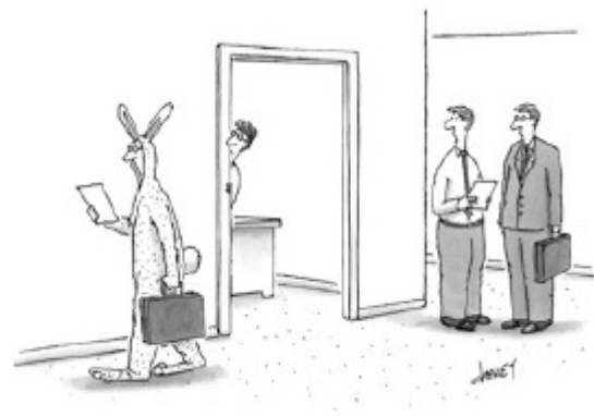
Figure 2: Cartoon number 32