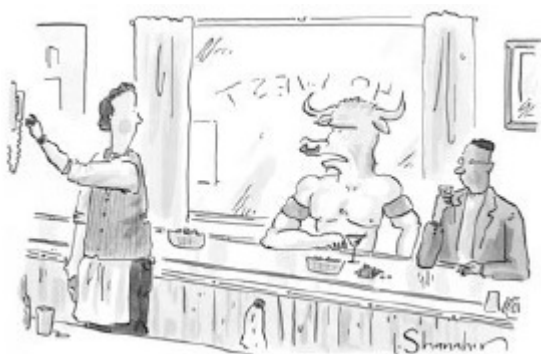
Figure 1: Cartoon number 31

The New Yorker Cartoon Caption Contest has been running for more than 10 years. Each week, the editors post a cartoon (cf. Figures 1 and 2) and ask readers to come up with a funny caption for it. They pick the top 3 submitted captions and ask the readers to pick the weekly winner. The contest has become a cultural phenomenon and has generated a lot of discussion as to what makes a cartoon funny (at least, to the readers of the New Yorker). In this paper, we take a computational approach to studying the contest to gain insights into what differentiates funny captions from the rest. We developed a set of unsupervised methods for ranking captions based on features such as originality, centrality, sentiment, concreteness, grammaticality, human-centeredness, etc. We used each of these methods to independently rank all captions from our corpus and selected the top captions for each method. Then, we performed Amazon Mechanical Turk experiments in which we asked Turkers to judge which of the selected captions is funnier.