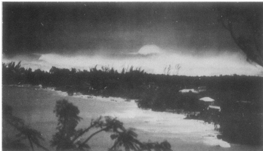
Fig. 2. Waves of Hurricane Allen breaking on East Fore Reef at Discovery Bay (Fig. 1, location E) at 0700, 6 August 1980. Wave heights were calculated to be 12 m; trees on shoreline are 15 m high.

Differences in damage to different growth forms (7) were particularly striking for corals, whose skeletal morphologies include branching, foliaceousness, encrusting, and head forms. As reported previously (5), branching species were more susceptible to hurricane damage than were massive heads (Fig. 4B). In an extreme example, at a depth of 6 m on