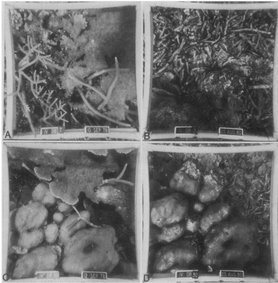
Fig. 3. Photostation on Monitor Reef (Fig. 1, location C; depth 6 m) before (September 1978) and 19 days after Hurricane Allen (each photograph 1/4 m 2 ). (A) Branching Acropora palmata (upper right), A. prolifera (lower left), and A. cervicornis (lower right) before Hurricane Allen. (B) The same quadrat after the hurricane showing total destruction of Acropora spp. (C) Acropora palmata overtopping massive Montastrea annularis before Hurricane Allen. (D) The same quadrat after the hurricane showing removal of A. palmata and lesions on M. annularis .