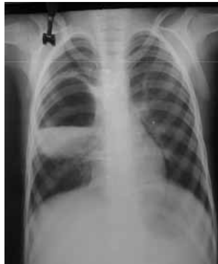
Fig. 1. Plain chest radiograph, postero-anterior view.

On examination at our institution he was pale and had a temperature of 38.3°C. There was no cyanosis, clubbing or lymphadenopathy. Chest examination revealed decreased chest expansion and air entry on the right side of the chest. The haemoglobin concentration was 9.7 g/dl and the white cell count 14.3 \times 10^9/l , with 82% neutrophils, 13% lymphocytes and 4% eosinophils. A chest radiograph showed a cystic lesion (Figs 1 and 2) with an air/fluid level. A provisional diagnosis of lung abscess was made. Intravenous antibiotics (ceftriaxone, sulbactam, amikacin, metronidazole) and antipyretics were commenced, and serological testing for hydatid disease was requested because the child came from a rural area and had close contact with livestock and dogs. The hydatid serological test was positive (titre 1:320). A