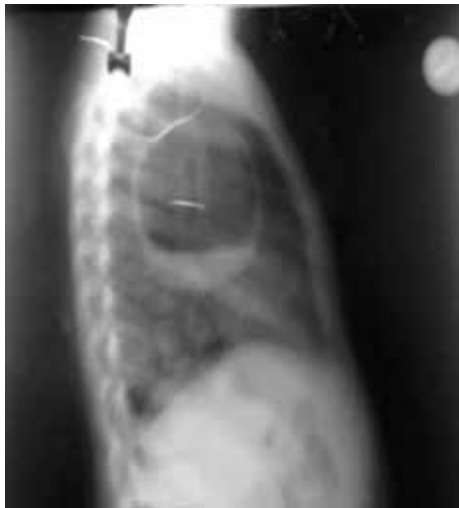
Fig. 2. Chest radiograph, lateral view.