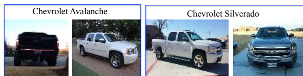
Figure 1. Illustration of large intra-class variance due to different views.

The goal of FGIC is to recognize objects that are both semantically and visually similar to each other. Since the seminal work of [23], deep convolution neural networks (CNN) have achieved the state-of-the-art performance on large-