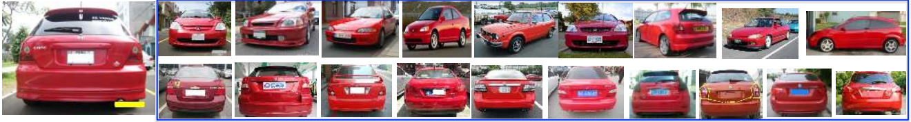
Figure 3. An query image (left) and retrieved images by Google (top right) and by Baidu (bottom right). Baidu search engine allows us to retrieve a large number of images with clean view annotations.

the class hierarchy is known or inferring the class hierarchy from the data), our approach is based on data augmentation which enables us to utilize as many auxiliary images as possible to improve the generalization performance of the learned features.