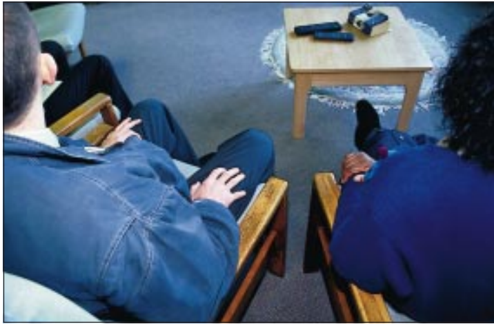
Is it the cognitive-behavioural component of the therapy that works, or is non-specific group support more important?

observational studies may be the only way of assessing an intervention, and some of these have undoubtedly been useful. To accept the randomised controlled trial as the best way of gauging efficacy is not necessarily to dismiss other study designs that have the same objective. 17 8 For example, no randomised controlled trial of the efficacy of condoms in preventing sexual transmission of HIV has been carried out. Given the seriousness of HIV disease and the consistency of early, albeit inconclusive, studies supporting condom use, such a trial would have been unethical. However, in a well designed prospective study of sexual partners whose HIV status differed, the seroconversion rate was zero between couples who used condoms consistently and about 5% per year in those who did not. 9 Given this evidence of condom efficacy, we can be more confident that the decrease in the rates of sexually transmitted diseases and HIV infection in Thailand is due to the effectiveness of a nationwide campaign that dramatically increased condom use in brothels. 10