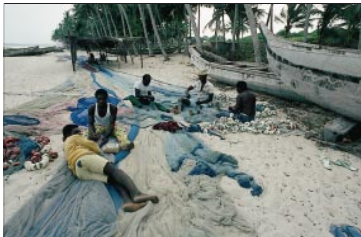
Although the relative risk of a cardiovascular event in people with high and normal blood pressure is similar in Africa and the United States, the absolute risk is up to 13 times greater in Africans

Sub-Saharan Africa is a diverse region comprising 47 countries. It is home to approximately 480 million people. 6 Among the elite in African society, the model for hypertension control currently in force in Europe and the United States would be entirely appropriate. However, most Africans (fully 75%) live in rural areas