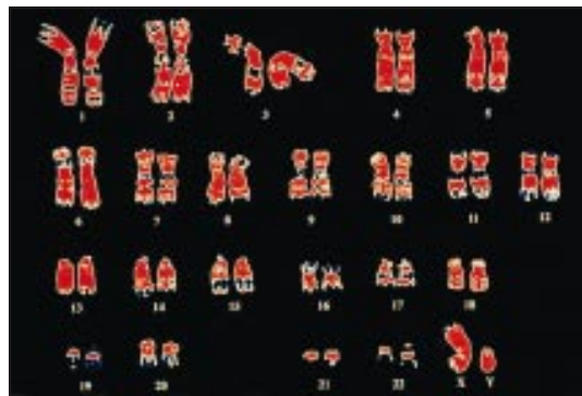
Understanding of how genes might modify our susceptibility to disease is evolving

One of the earliest applications of this genetic information will be in the discovery and development of new drugs. Genetics is now widely used to identify new targets for drug designs, and it is increasingly recognised that defining disease populations by genotype will probably correlate with response to drug treatment. The variety of mechanisms that underlie complex disease may account for the wide variations in response seen in clinical practice and the difficulty often encountered in