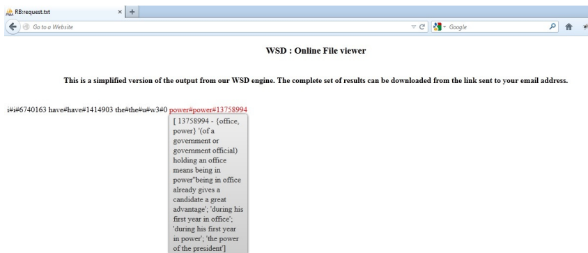
Figure 2: screen-shot of the online interface showing the online output viewer

Our system generates the output files in UKB format as stated earlier. This output can be easily parsed, however, it is not suitable for manual analysis. Our interface provides the users with a facility of viewing the output online, where the sense tags are accompanied with the sense gloss and examples as available in the wordnet. This enables the user to easily comprehend the output. Figure 2 shows a screen-shot of the online output viewer. The interface also provides an output pane, where the results of the job are summarized, and a link to the results is provided, so that the user can download them. The same link is also sent to the user to the specified e-mail address.