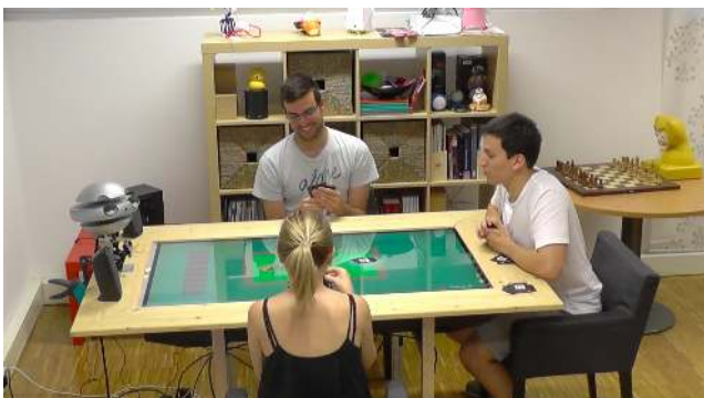
Fig. 1 Experimental setting for Study 1.

We recruited a total of 30 university students (17 males and 13 females) with ages ranging from 19 to 42 years old ( M = 23.03 ; SD = 4.21 ). Among the participants, 56.7% had a high level of expertise in the game, 40% had a moderate level of expertise, and only 3.3% had never played the game before. Regarding previous interactions with the EMYS, 24 participants had previously interacted with it, and 6 were interacting with it for the first time.