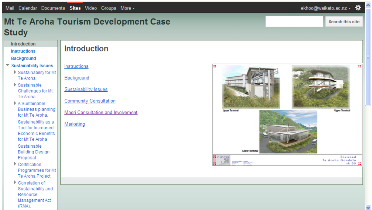
Figure 1 The wiki used to facilitate a collaborative case-study role-play project

The teacher received Moodle support from the department's technical team and curriculum design support (particularly for the wiki project) from university-level e-learning staff.