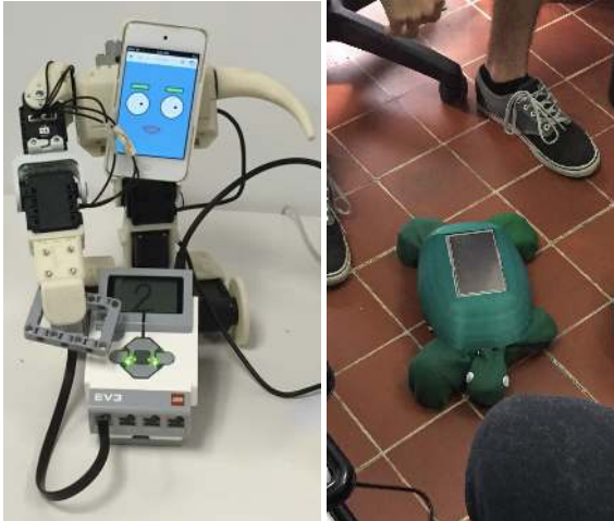
Figure 2: Different robots built in-house for cognitive therapies, including TBI and autism.

and after the injury, however, TBI sufferers encounter the need to develop and the acquire new cognitive functions, which is crucial in young populations [17].