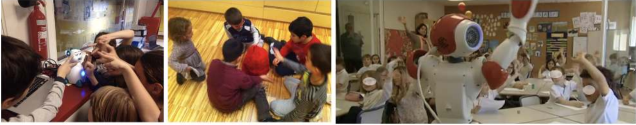
Figure 1: From left to right, a) the robot can have the function of social agent, b) robot as a playful tool, and c) robot as a coach.