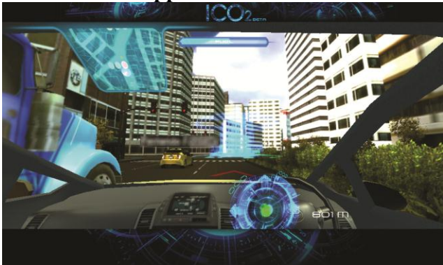
Figure 1. A screenshot of the iCO 2 application on Facebook. The blue “wheel” (mid-right) is the driving interface. It shows “green” to indicate eco-friendly driving behavior

iCO 2 is an online tool for practicing eco-safe driving with multiple networked users. In September 2012, iCO 2 was launched as an application on Facebook. 1 The 3D scenario depicts an area in Tokyo of about 1 km 2 . Users can control the direction and speed of the car operating a mouse-based interface (see Figure 1). The interface will change its color to indicate eco-friendliness in a continuous color range from green (eco-friendly) to red (eco-unfriendly), based on the EMIT emission model [4]. As a first approximation, eco-friendliness is defined by smooth acceleration and deceleration only.