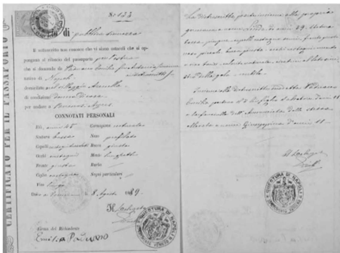
Figure 2. Pages from an Italian Passport Application file. Naples, Italy.

have been found, the bulletins were issued weekly or more frequently. Again, the time period during which this procedure was used is limited and their use not fully studied.