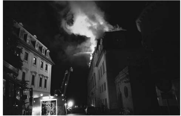
The Night of the 2nd September 2004.

Total losses occurred among works dating from the 16th to 20th centuries, in particular from the 17th and 18th centuries. These include Duchess