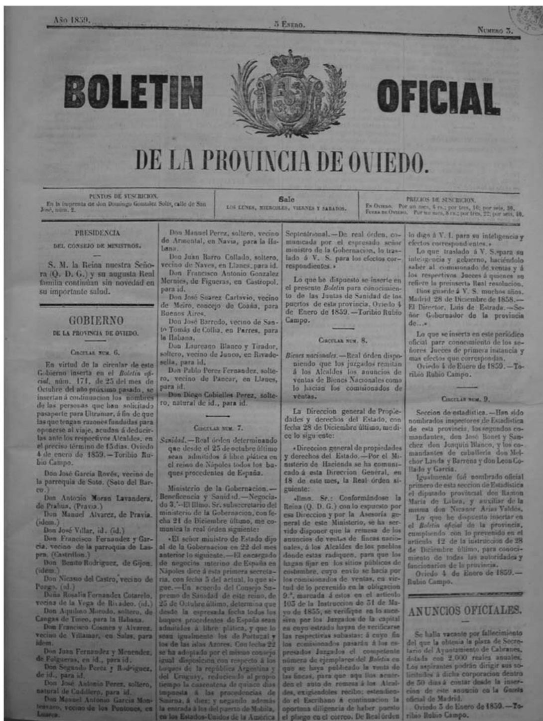
Figure 3. Published notice of intent to emigrate, Oviedo, Asturias, Spain.

Little has been done to identify these types of records and less to extract the information that they contain.