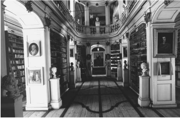
The Rococo Hall of the Herzogin Anna Amalia Library before the fire.

can say for sure which books were destroyed by the fire and which were damaged and will be returned. A new data bank will be compiled to document and classify the damages. This expert task will last well into 2006. Only then can the restoration begin on a large scale, apart from several pieces demanding immediate attention. Part of the restoration can be done in the library's own workshop for book restoration and conservation or in workshops of partner libraries, and part will be commissioned to third parties. The restoration of the 62,000 books is a challenge that will occupy the library for more than ten years.