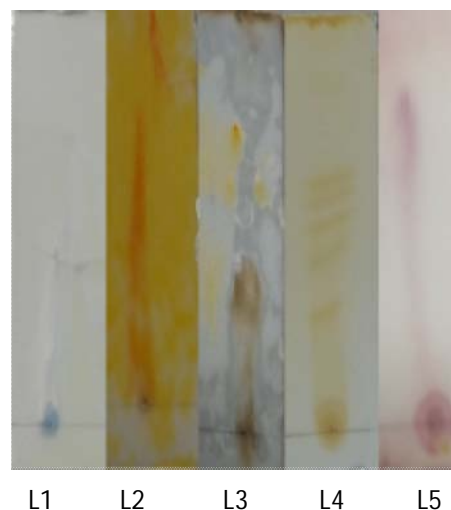
Figure 2: Parotoid gland extraction of Bufo melanostictus

Parotoid gland secretion in the presence of Iodine reagent; L5 Parotoid gland secretion in the presence of Ninhydrin reagent.