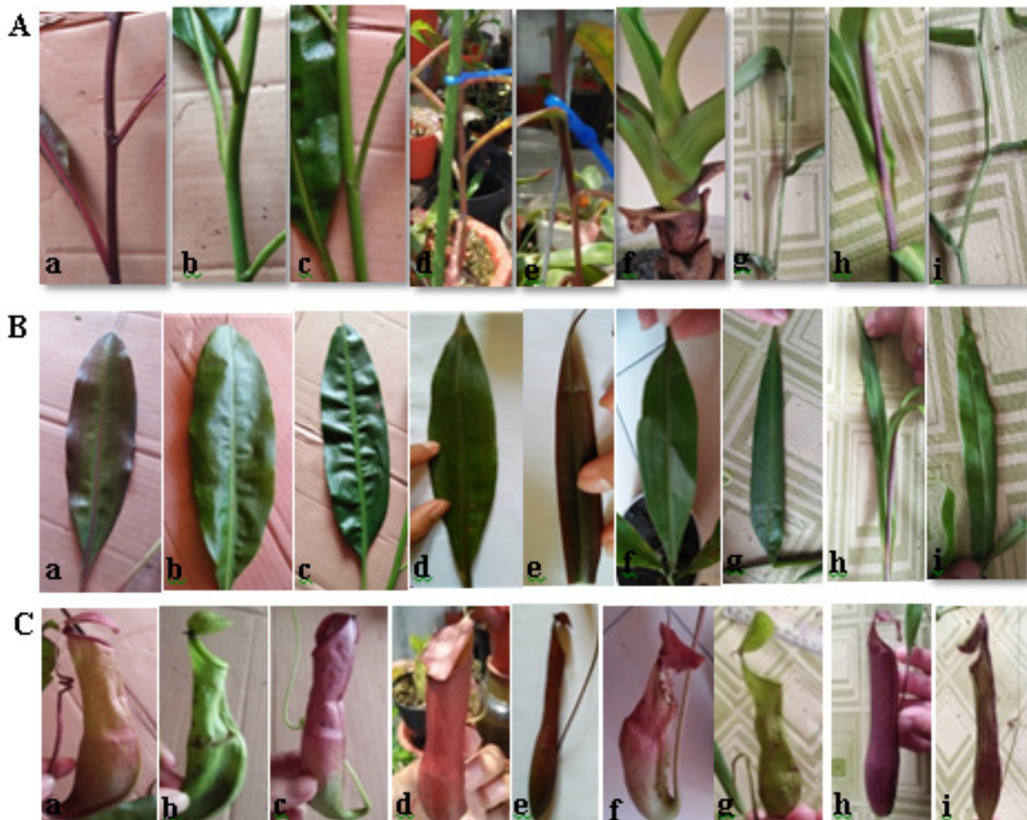
Figure 1. Characteristics stem (A), leaves (B), and pitcher (C) of Nepenthes spp. discovered at research sites. TR1; b. TR2; c. TR3; d. BP1; e. BP2; f. BP3; g. AI1; h. AI2; i. AI3