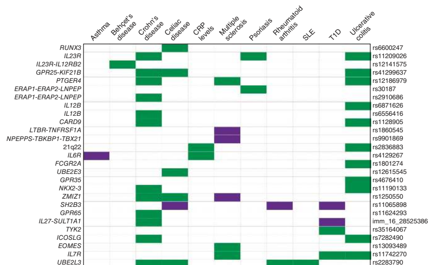
Figure 3 Ankylosing spondylitis genetic susceptibility loci overlap with those of other autoimmune diseases. Diseases are represented in columns, and ankylosing spondylitis susceptibility loci are represented in rows. Shared susceptibility loci are colored green if effect size is concordant and purple if effect size is discordant. Data are shown in Supplementary Table 8 . SLE, systemic lupus erythematosus; T1D, type 1 diabetes.

tested on a reduced sample subset of individuals from the UK (7,447 cases and 11,479 controls). Considering loci with common variant associations achieving genome-wide significance, we identified six that harbored rare SNPs that were disease associated ( P < 5 \times 10^{-3} ; Supplementary Table 11 ). These associations remained significant after conditioning on the common variants, and variants at three loci ( IL23R , TYK2 and KEAP1 )