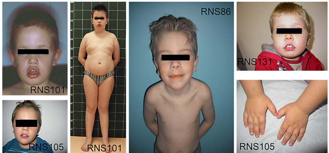
Fig. 1. Photographs of faces and extremities of some patients carrying an RAI1 mutation.

scribed in table 1. PCR products were purified and then analyzed by direct sequencing using the BigDye terminator v3.1 Cycle Sequencing Kit and the ABI Prism 3130 Genetic Analyzer (all from Applied Biosystems, Carlsbad, Calif., USA). The gene mutation nomenclature used in this article follows the recommendations of den Dunnen and Antonarakis [2001]. When material from the parents was available, a family study was performed to prove that the mutation occurred de novo .