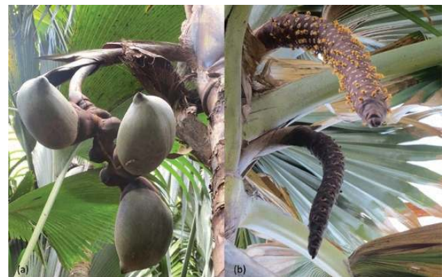
Figure 1. Lodoicea maldivica inflorescences. (A) Female with fruits and unfertilised flowers. (B) Male catkins.

We identified potential sex-linked genetic markers using the approach of Scharmann et al. (2019). Genomic DNA was extracted from the leaf tissue of 20 male and 20 female trees, following an optimised version (Morgan et al. 2016) of the DNeasy® 96 Plant Kit (Qiagen, Hombrechtikon, Switzerland) manufacturer's protocol. The genomes of the 40 individuals were sequenced using a ddRAD protocol (Peterson et al. 2012),